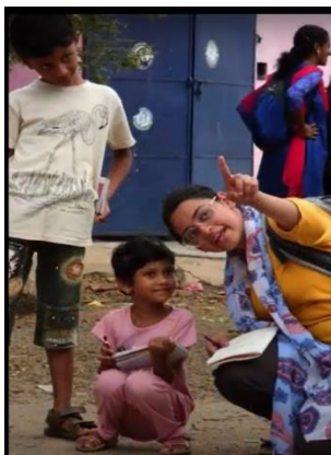
Team - Pramiti.mp4